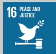
Related to SDG 16.5

GRI Indicator(s): 308-2: Negative environmental impacts in the supply chain and actions taken.