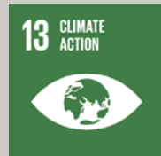
Related to SDG 12.4 & 13.2

GRI Indicator(s): Own indicator: Trust Index for 2022 in per cent