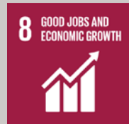
Related to SDG 8.3

GRI Indicator(s): 414-2: Negative social impacts in the supply chain and actions taken